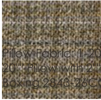
Pile Fabric: 1-20" x 20" Pile with 2" Boxing 2848-28CC