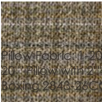
Pillow Fabric: 1-20''' x 20''' Pillow with 2 Boxing 2843-28CC