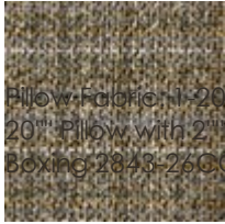
Plow Fabric: 1-20" x 20" Plow with 2" Boxing 2843-260C