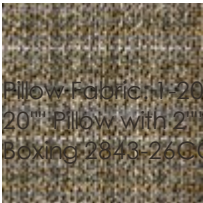
Pillow Fabric: 1-20"" x 20"" Pillow with 2"" Boxing 2843-260C