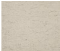
Body Fabric: 2842- 87CC-P Performance