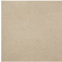
Body Fabric: Outside 2846-34CC-P Performance, Inside 2845-34CC-P Performance