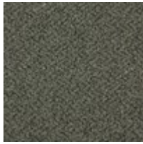
Pillow Fabric: 1-23.5" x 14.5" Back Pillow 2841-55CC-P