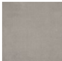
Pillow Fabric: 2-20''' x 20''' Pillows with 2'''