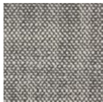
2-18''' x 18''' Pillows with 2''' Boxing 2838-