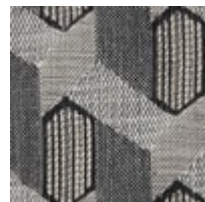
1-18''' x 18''' Pillow 8408-91CC