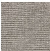
Body Fabric: 2793-92CC