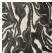
1-19" x 19" Pillow 8387-92CC