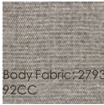
Body Fabric: 2793-92CC