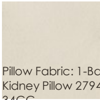
Pillow Fabric: 1-Back Kidney Pillow 2794-34CC