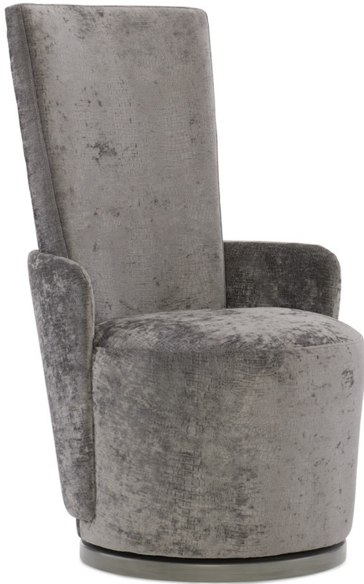
RENDITION SWIVEL CHAIR