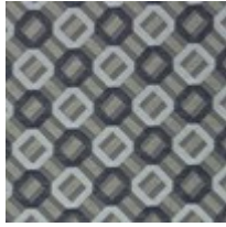
Pillow Fabric: 2-20" x 20" Boxed Pillows with 1.5" Boxing 8385-11CC