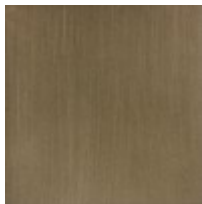
Bronze Gold Metal