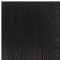
Black Stained Ash