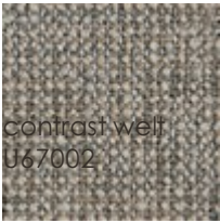
contrast welt U67002