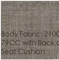
Body Fabric: 21005-79CC with Back and Seat Cushion