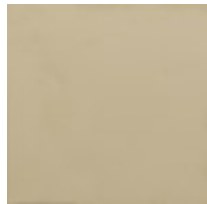
Whisper of Gold