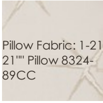
Pillow Fabric: 1-21'' x 21'' Pillow 8324-89CC