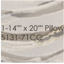
1-14'' x 20'' Pillow 5131-71CC