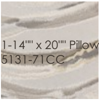
1-14'' x 20'' Pillow 5131-71CC