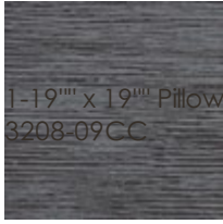
1-19'' x 19'' Pillow 8208-09CC