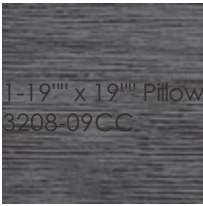
1-19'' x 19'' Pillow 3208-09CC