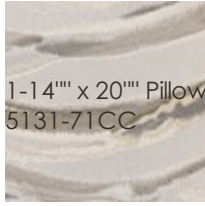
1-14'' x 20'' Pillow 5131-71CC