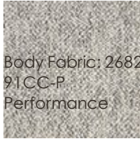
Body Fabric: 2682-91CC-P Performance