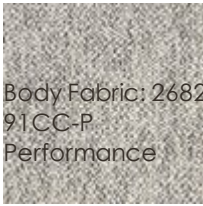
Body Fabric: 2682-91CC-P Performance