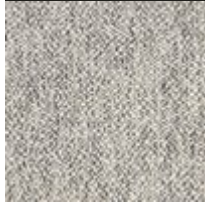
Body Fabric: 2682-91CC-P Performance