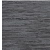
1-19" x 19" Pillow 3208- 09CC