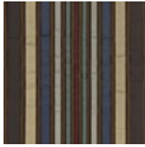
Outside 2685-55CC, Inside 2680-55CC