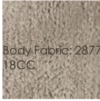
Body Fabric: 2877- 18CC