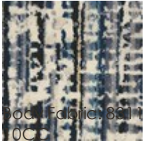
Mod. Fabric, 8211-000