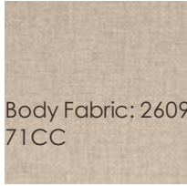
Body Fabric: 2609-71CC