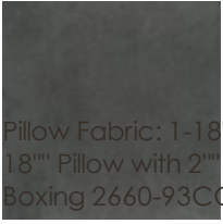
Pillow Fabric: 1-18" x 18" Pillow with 2" Boxing 2660-93CC