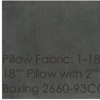
Pillow Fabric: 1-18" x 18" Pillow with 2" Boxing 2660-93CC