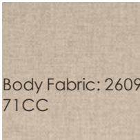
Body Fabric: 2609-71CC