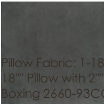
Pillow Fabric: 1-18"" x 18"" Pillow with 2"" Boxing 2660-93CC