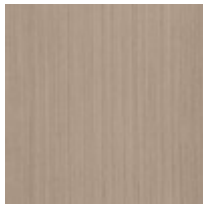
Serene Dark Taupe