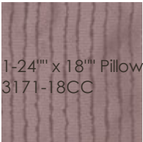
1-24-18 x 18 Pillow 3171-18CC