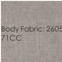
Body Fabric: 2605-71CC