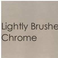
Lightly Brushed Chrome