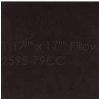
1-17-17 x 17 Pillow 2595-79CC