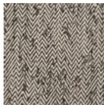
2-18" x 18" Pillows 8262-95CC