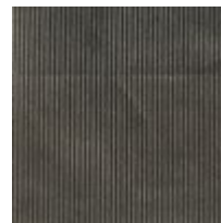
1-24" x 16" Pillow 2582-92CC