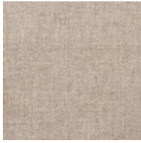
Body Fabric: 2573-71CC