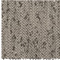
1-18 ''' x 18 ''' Pillow 8262-95CC