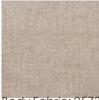
Body Fabric: 2573-71CC