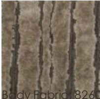
Body Fabric 8260- 18CC