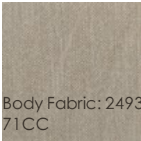
Body Fabric: 2493- 71CC