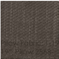
Pillow Fabric: 1-19''' x 19''' Pillow 2568- 91CC