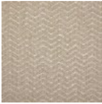
Body Fabric: 2544-71CC