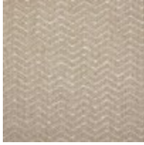
Body Fabric: 2544- 71CC