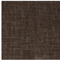
Pillow Fabric: 1-18''' x 18''' Pillow 2543- 78CC