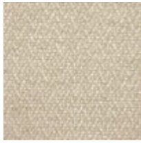
Body Fabric: 2546- 34CC