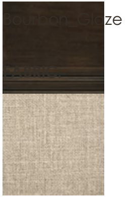
Body Fabric: 2447-34CC