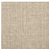
Body Fabric: 2447-34CC