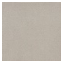
Soft Silver Paint