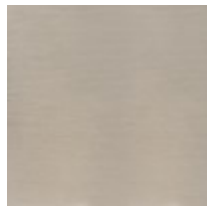
Lightly Brushed Chrome