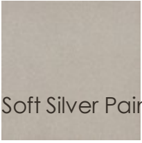
Soft Silver Paint