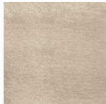
Soft Silver Leaf