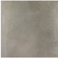
Taupe Silver Leaf