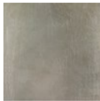
Taupe Silver Leaf