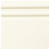
Wedding Dress White