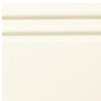
Wedding Dress White