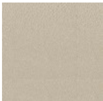
Tray: 9047- 83CC