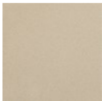
Soft Silver Paint Gloss