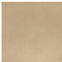
Golden Blonde Leaf