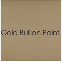
Gold Bullion Paint