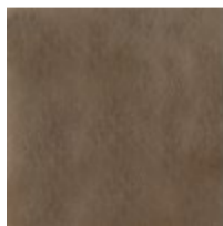
Brushed Antique Brass