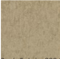
Body Fabric: 2894- 74CC-P Performance