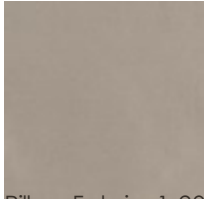
Pillow Fabric: 1-20''' x 20''' Back Pillow 3251-93CC