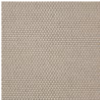
Body Fabric: 2811-75CC