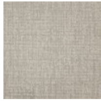
Pillow Fabric: 1-22" x 18" Pillow 3243-74CC