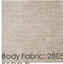
Body Fabric: 2805- 35CC-P Performance