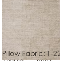
Pillow Fabric: 1-22''' x 18''' Pillow 2805- 35CC-P Performance