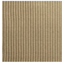
1-20''' x 20''' Pillow 2452-12C