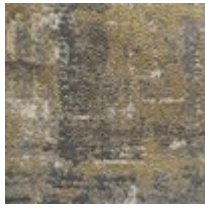
Pillow Fabric: 1-22''' x 22''' Pillow 5123-11C