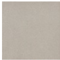
Soft Silver Paint