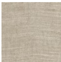
Body Fabric: 2427-74CC