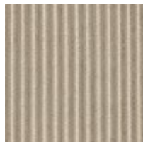
2-19''' x 19''' and 1-24''' x 12''' Pillows 3084-74CC