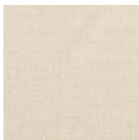
Body Fabric: 2531-34CC