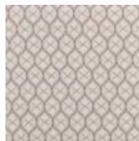
2-21"x21" Pillows 8225-16CC