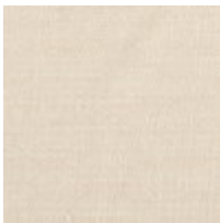
Body Fabric: 2531-34CC