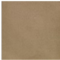
Fabric: 9066- 44CC