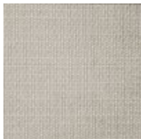
Body Fabric: 2810-35CC-P