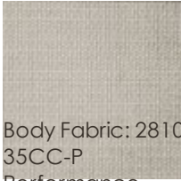
Body Fabric: 2810- 35CC-P Performance