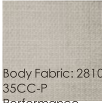
Body Fabric: 2810- 35CC-P Performance