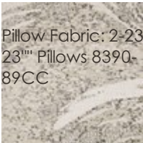
Pillow Fabric: 2-23 23 Pillows 8390-89CC